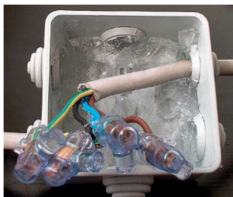
Lay one portion of Easyisogel on the bottom of the box. Perform wiring.