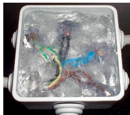
Close the box cover.