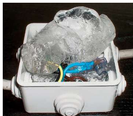
Fill the box well with Easyisogel, without leaving any empty spaces.